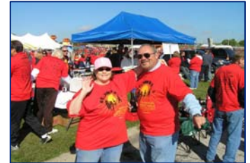
Members of our walk team are already calling asking us when do we start?!