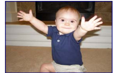
I have never been great about asking people for money, but this is so different. People were offended if I didn't ask!