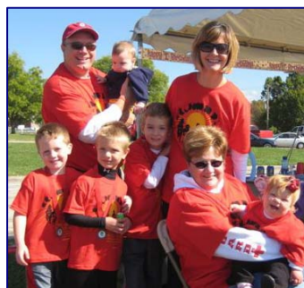
The Walk gave us hope and made us laugh together with friends!

We received back so many wonderful words of encouragement. It was so incredible to know how many people we were reaching. The day of the walk was great. Friends and family who had never participated in the Walk were there to support this wonderful cause. Families spent time together eating, playing games, and using the opportunity to discuss how differences in all of us are what give the world color.