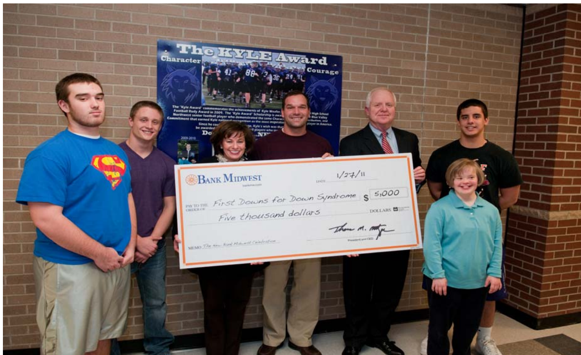
Pictured above from left to right:

Thank you Bank Midwest! We appreciate your support!